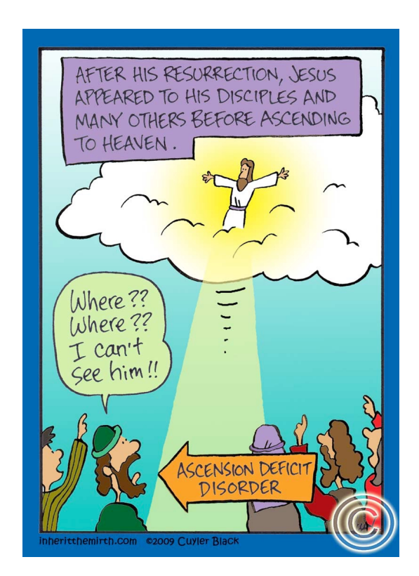
Find other cartoons like this, greeting cards, T-shirts, and much more at www.lnheritTheMirth.com.

Attention Deficit Disorder Association: Helping Adults with ADHD Lead Better Lives www.add.org